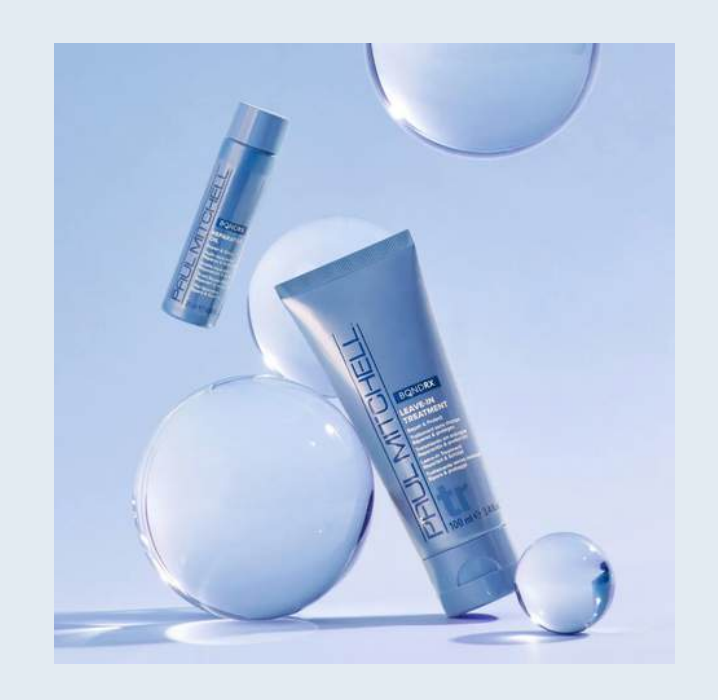
BOND RX LEAVE-IN TREATMENT

Repair, condition and fortify damaged hair with instant softness and frizz control. This leave-in treatment is infused with Bond Rx Technology to help repair and reinforce hair. Formulated with heat protection to help prevent further damage.