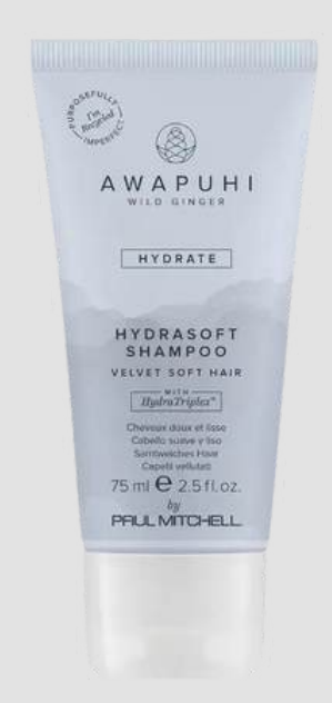
AWAPUHI HYDROSOFT SHAMPOO

Gently cleanse hair while replenishing moisture with this color-safe, sulfate-free, hydrating shampoo. The HydraTriplex<sup>™</sup> blend of amino acids, vegetable protein and nourishing oils deeply hydrates, binds and seals the hair.