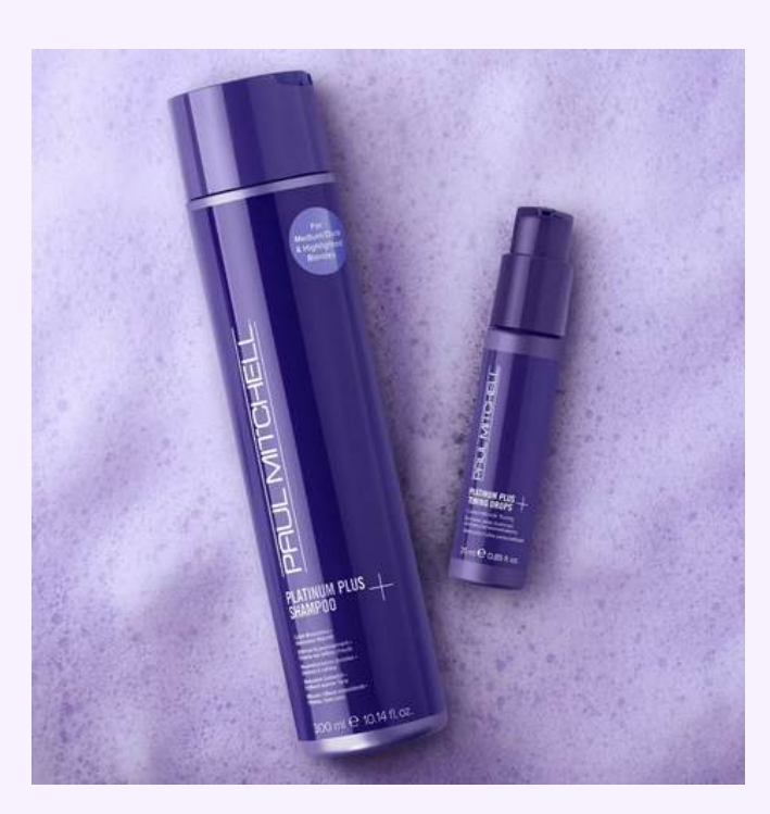
PLATINUM PLUS SHAMPOO

Powerful toning for medium to dark blondes or highlighted blondes. This deep purple shampoo instantly tones and corrects yellow, brassy tones and brightens highlights. For best results, use weekly.