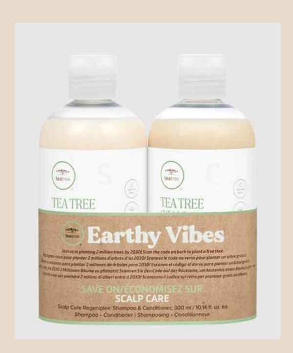
TEA TREE SCALP CARE

Color-safe shampoo features a botanical blend of Kakadu plum, pea peptides, clover flower, turmeric and ginseng to revitalize the scalp and help hair look thicker and fuller. Light conditioner features a blend of Kakadu plum, pea peptides, clover flower, turmeric and ginseng to help prevent breakage and add volume for fuller, thicker-looking hair.