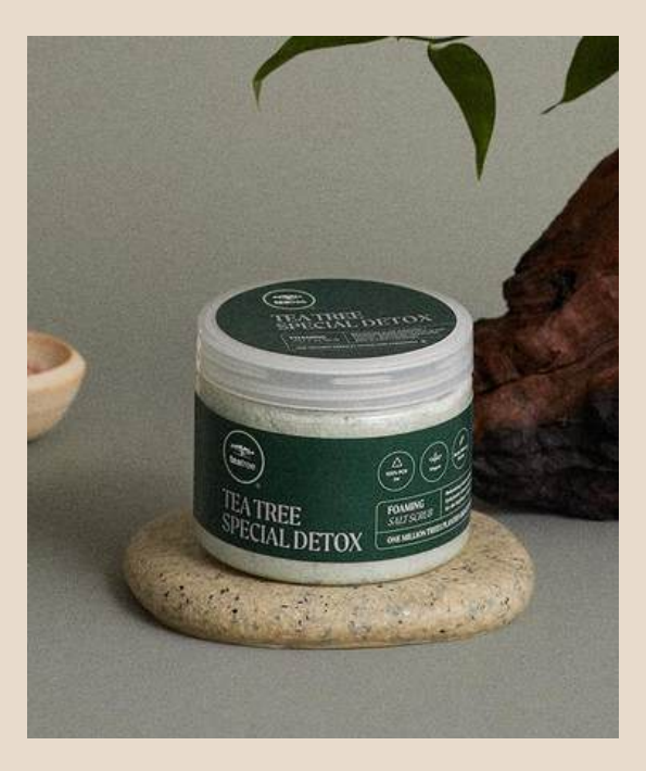
TEA TREE FOAMING SALT SCRUB

Best used for all hair types to promote hair growth and strengthen the hair at the root. It can help cut down on the amount of hair shedding.