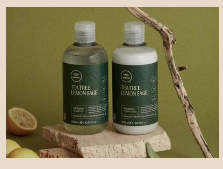
TEA TREE LEMON SAGE

Wash contains thickening agents that boost volume, while panthenol strengthens every strand. Add volume, while lightweight conditioners protect hair and add shine. Uplifting lemon, soothing sage, tingly peppermint and tea tree energize mind, spirit and hair.