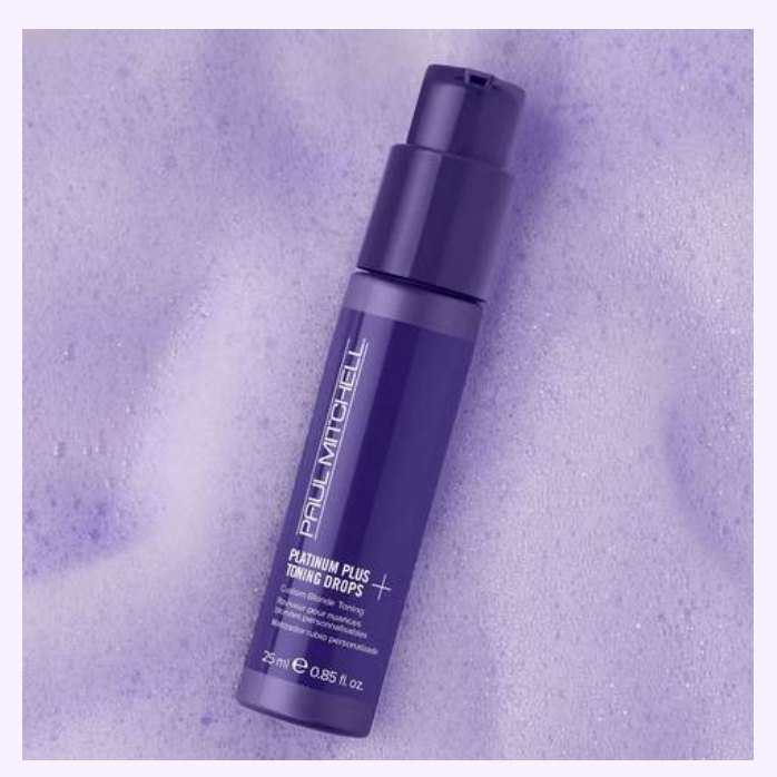
PLATINUM PLUS TONING DROPS

Instantly tone blonde, highlighted, gray or silver hair with customizable toning drops powered by concentrated purple pigments. Cool warmth and banish brass. Use several pumps, until you reach the desired level of toning.