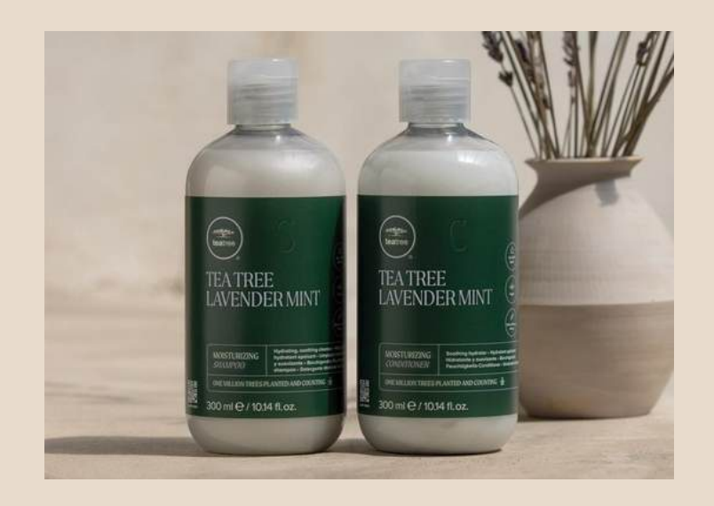
TEA TREE LAVENDER MINT

Cleanses, soothes and replenishes dry and textured hair. Dreamy scent of lavender, mint and tea tree.