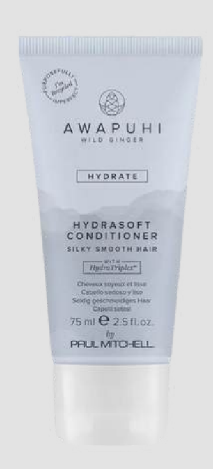
AWAPUHI HYDROSOFT CONDITIONER

Condition and replenish hair while providing optimal moisture with this hydrating conditioner. The HydraTriplex™ blend of amino acids, vegetable protein and nourishing oils deeply hydrates, binds and seals the hair.