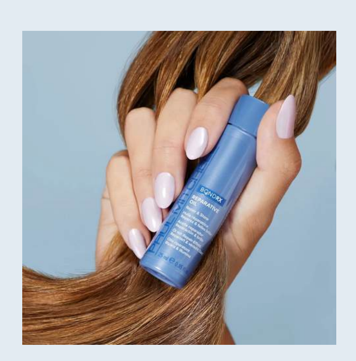
BOND RX REPARATIVE OIL

Repair dry, damaged hair while restoring softness and shine. This reparative oil is infused with Bond Rx Technology to help strengthen the hair and seal the cuticle for a smooth, frizz-free finish.